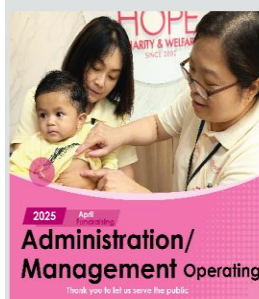
2025 April Fundraising Administration/ Management Operating Thank you to let us serve the public