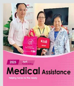
2025 April Fundraising Medical Assistance Helping hands for the needy