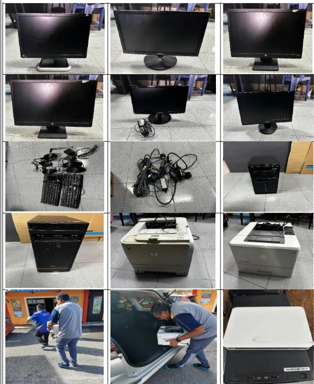
Donation To Sk Mak Mandin Butterworth Penang.